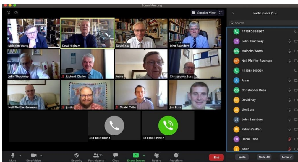
Some of the Trustees and students who were able to meet on Zoom during the last Seminary weekend.

Recently, seven men have been meeting together regularly to discuss providing support to Biblical and like-minded churches, or those aspiring to establish such churches. They have formed the ‘Church Support Fellowship’, desiring to “strengthen the things that remain”.